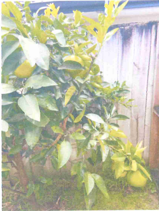
Exhibit B: SUBSTENANCE Land of sustenance showing fruit trees