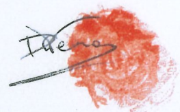
Thumbprint with own Right hand