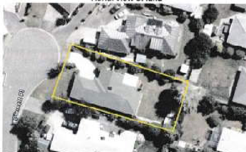
Aerial view of land

Map showing land with approximate co-ordinates of the land of substance commonly known as 12 Clemett Place, Kaiapoi, Canterbury [7630], outlined in yellow Latitude -43.391° S and Longitude 172.644° E