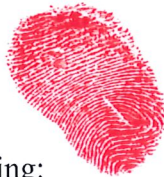
Photo of accurate likeness being: