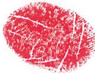
Photo of accurate likeness being: