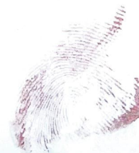
Thumbprint with own Right hand over autograph;