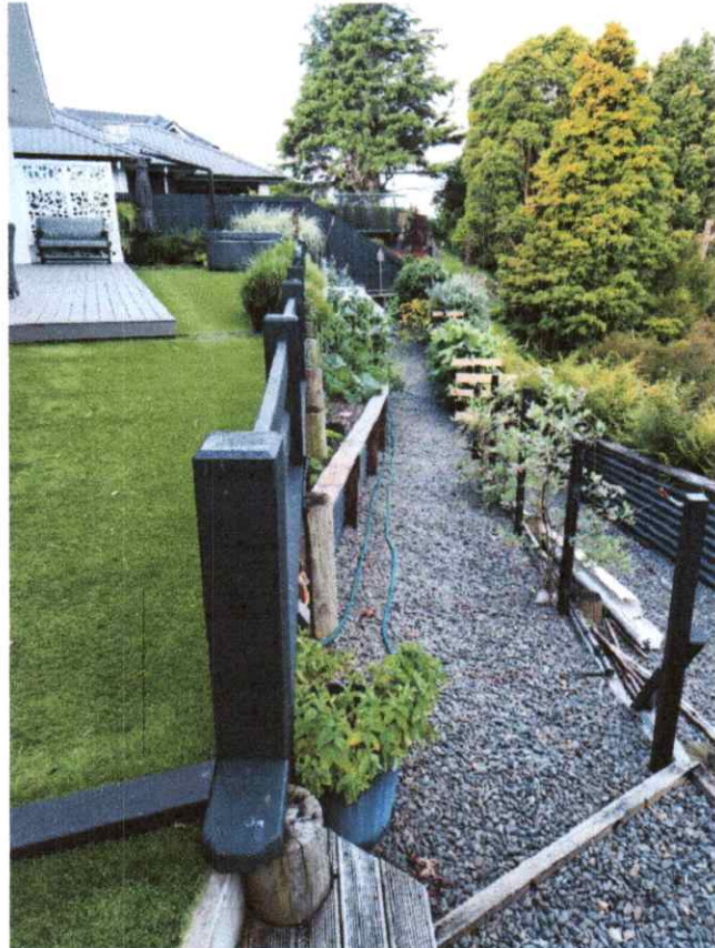
Exhibit B: Sustenance Land of substance showing vegetable gardens