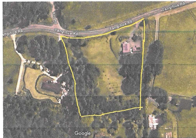
Exhibit B: Sustenance

Aerial view of your land with outlines – can take off council site or google earth