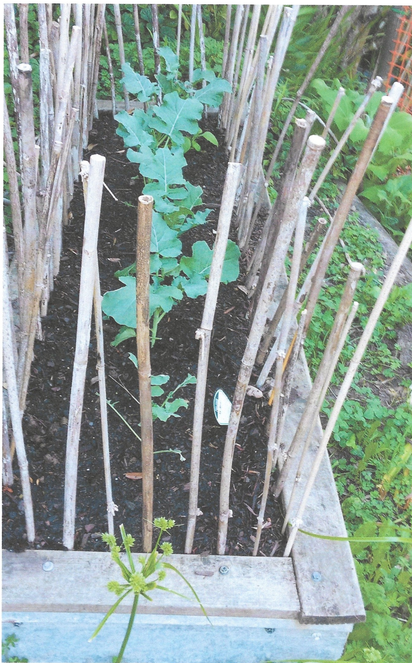
Exhibit B: Sustenance Land of substance showing vegetable gardens